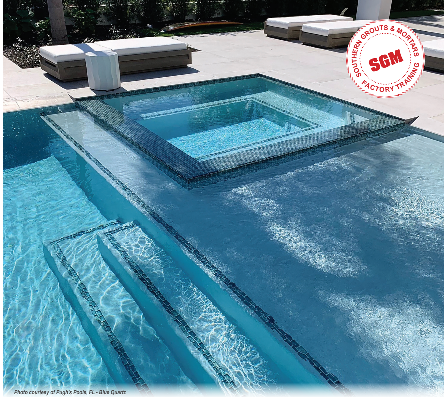
Blue Quartz