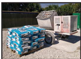
SIZING & PREPARATION